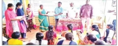
శిక్షణ పూర్తిచేసిన వారికి ధృవపత్రాలు అందజేస్తున్న ధృవం