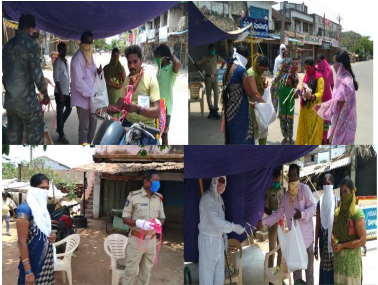
Distributing the Masks and TATA gluco energy drinks to the police people at Tallapalem Police security campus. Kasimkota Mandal