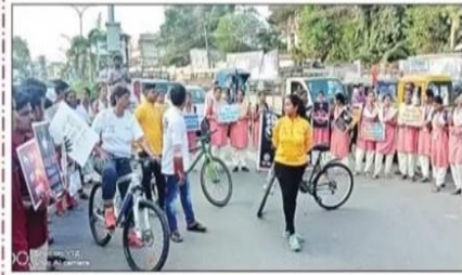
అజిద్ సింగ్ లో మానవ వహరం నిర్మూలనపై ధృత్యం